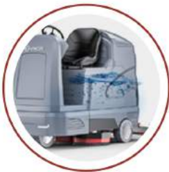
LARGE CAPACITY WATER TANK