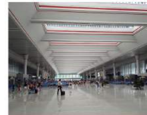
HIGH SPEED RAILWAY