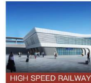
HIGH SPEED RAILWAY