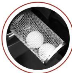
WATER TANK FLOAT SENSOR