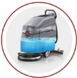
DOUBLE WATER TANK LARGE CAPACITY