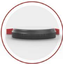
QUALITY BRUSH STRONG WATER ABSORPTION