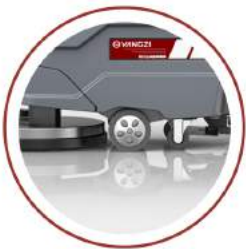
RUBBER NON-SLIP WEAR-RESISTANT WHEELS