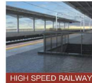
HIGH SPEED RAILWAY