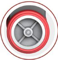
RUBBER ANTI-SKID WHEEL