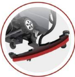
CORROSION RESISTANT SQUEEGEE