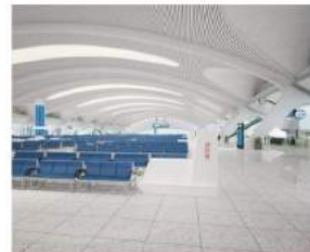
HIGH SPEED RAILWAY