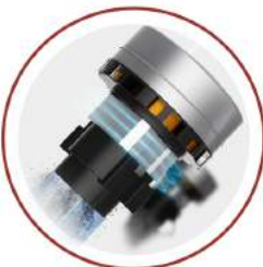
POWERFUL COPPER CORE MOTOR