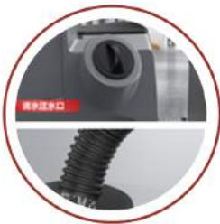
DOUBLE OUTLET SYSTEM