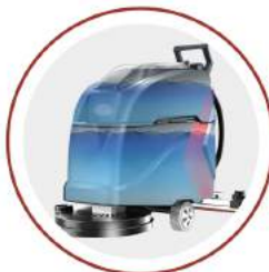
LARGE CAPACITY WATER TANK