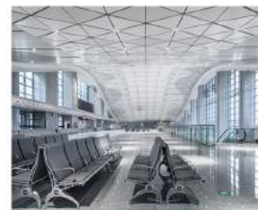
HIGH SPEED RAILWAY