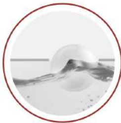
WATER TANK FLOAT DEVICE