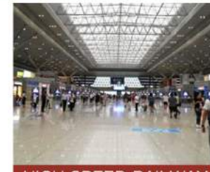
HIGH SPEED RAILWAY