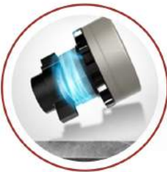
POWERFUL COPPER CORE MOTOR