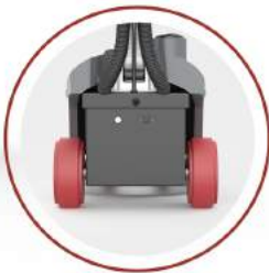
LARGE CAPACITY WATER STORAGE