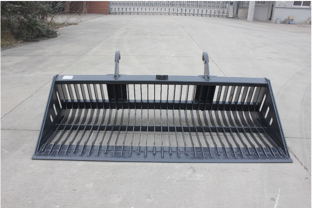
BM33A20 Silage Facer